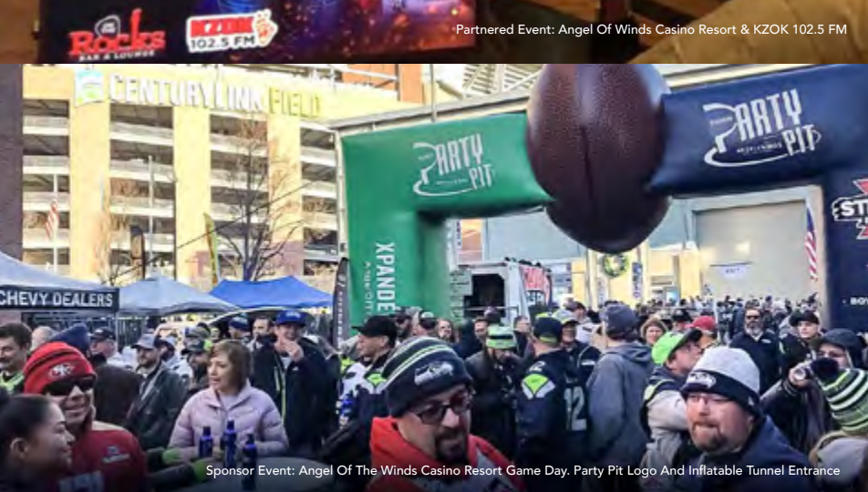
Sponsor Event: Angel Of The Winds Casino Resort Game Day. Party Pit Logo And Inflatable Tunnel Entrance