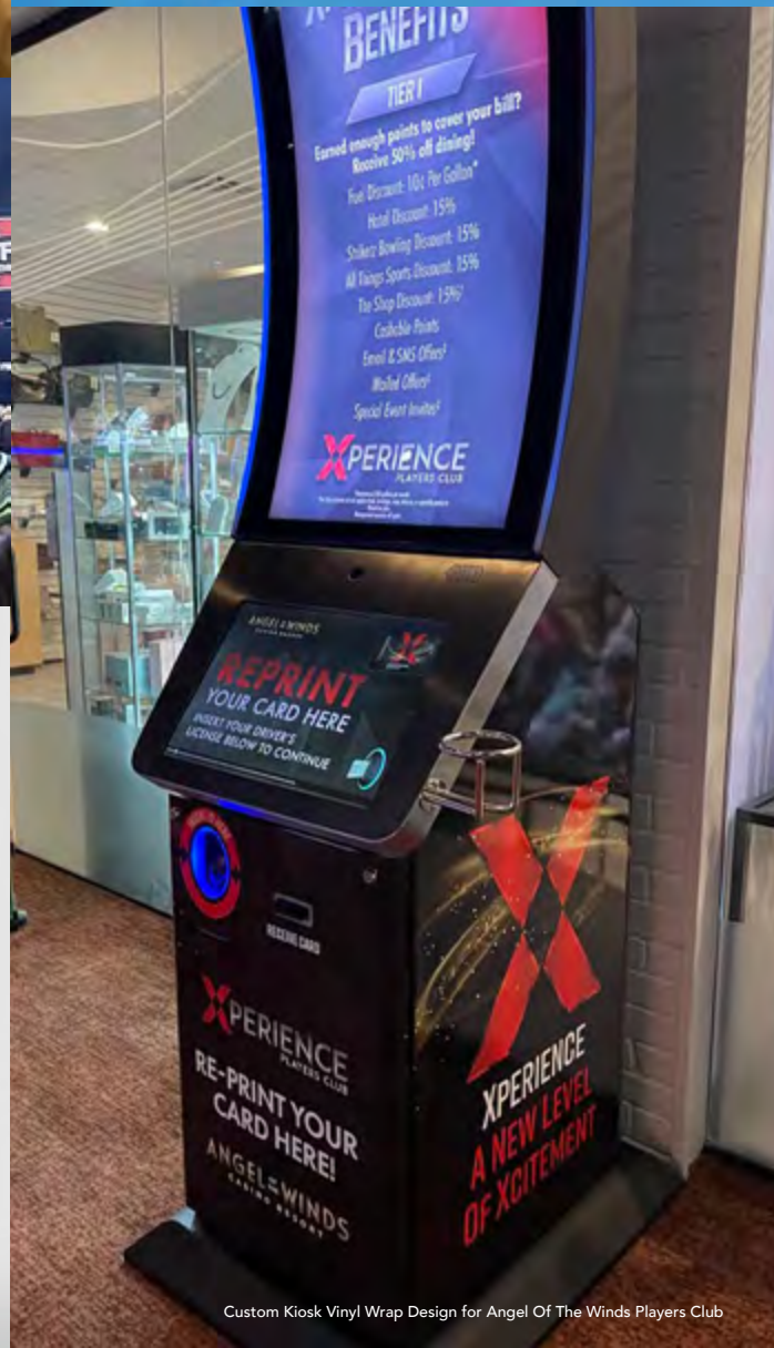
Custom Kiosk Vinyl Wrap Design for Angel Of The Winds Players Club