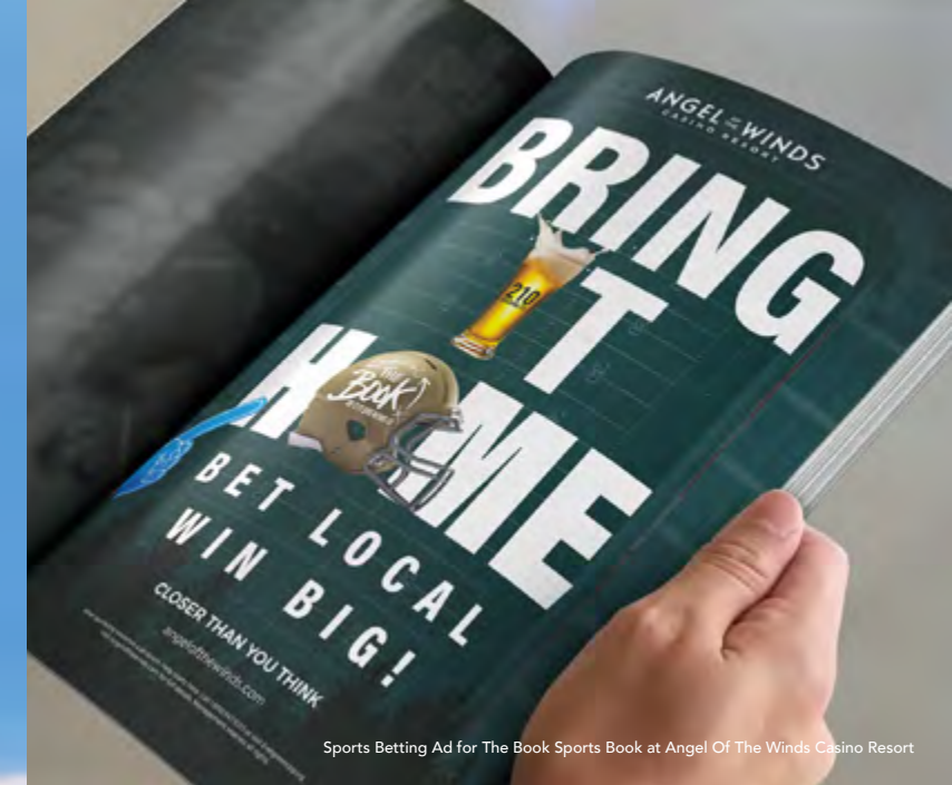
Sports Betting Ad for The Book Sports Book at Angel Of The Winds Casino Resort