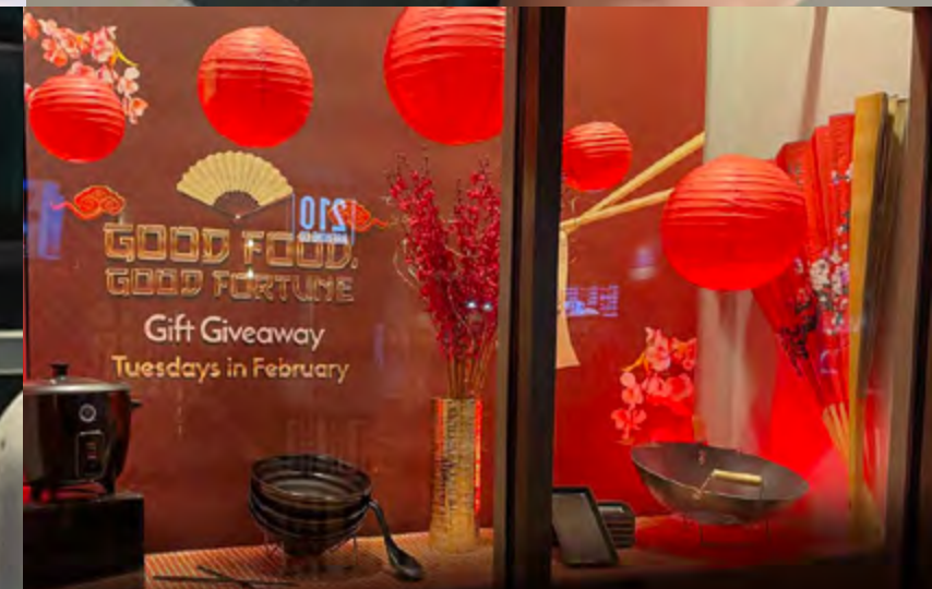
Custom Promotion Backdrop, Table Top, & Window Clings For Gift Giveaway Promotion At Angel Of The Winds Casino Resort