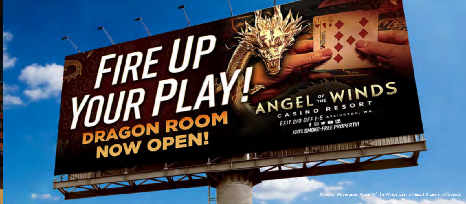
Outdoor Advertising Angel Of The Winds Casino Resort & Lamar Billboards