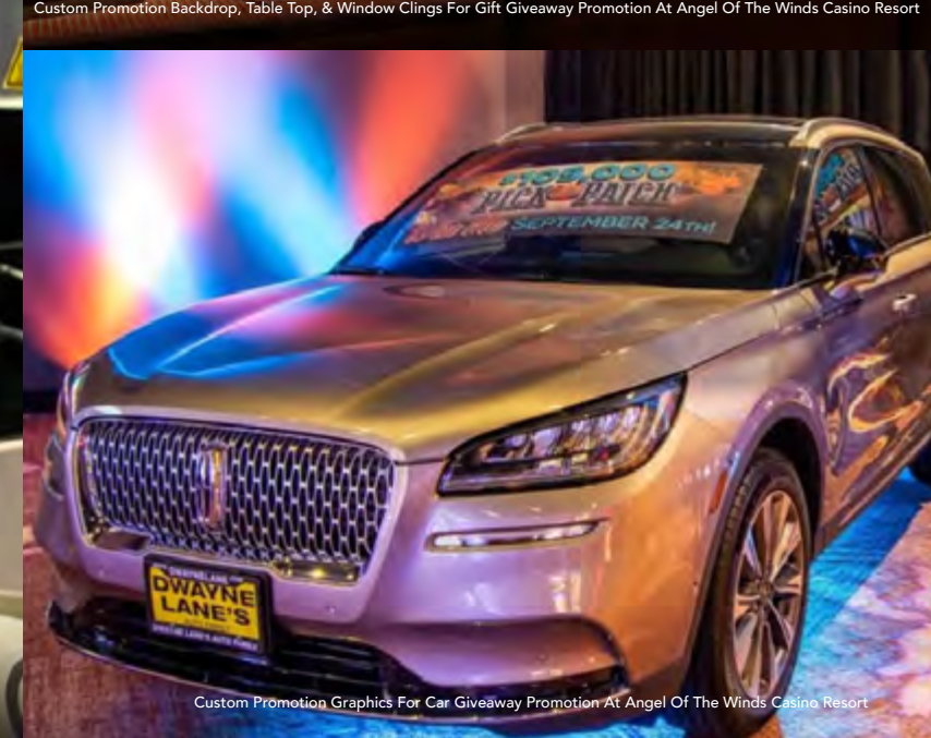
Custom Promotion Graphics For Car Giveaway Promotion At Angel Of The Winds Casino Resort