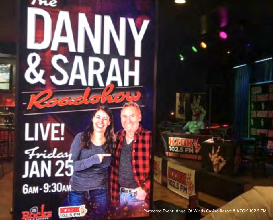
Partnered Event: Angel Of Winds Casino Resort & KZOK 102.5 FM