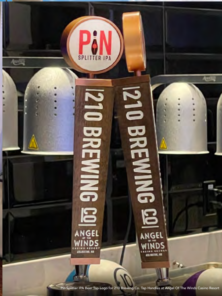
Pin Splitter IPA Beer Tap Logo for 210 Brewing Co. Tap Handles at Angel Of The Winds Casino Resort